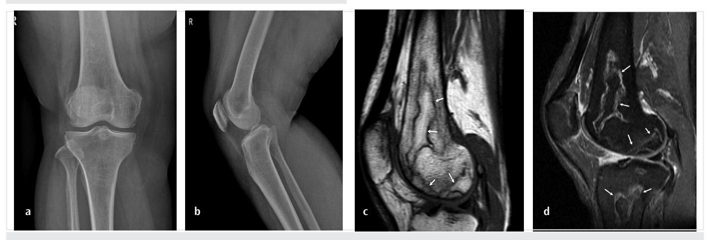
Figure 3. a-d. A 28-year-old female patient with systemic lupus erythematosus treated with corticosteroid for 7 years. Anteroposterior (a) and lateral (b) X-rays are unremarkable. Sagittal T1-Weighted (T1-W) spin-echo (c) and sagittal proton density weighted-fast spin-echo (d) images show multifocal serpiginous areas consistent with osteonecrosis that also involves the subarticular region (arrows)

CS-induced ON tends to be multifocal lesions at multiple joints, as illustrated by studies of patients with SLE who are on long-term CS therapy (2,18,19). Similarly, we found that five of 16 (31.3%) patients with knee joint ON had femoral head ON who were complaining of hip joint pain. In the presence of multiple joint pains in patients receiving CS therapy, clinicians should be aware of ON. We suggest that knee joint MRI should be performed to exclude the presence of ON if plain radiography is unremarkable and patient still complains of knee joint pain.