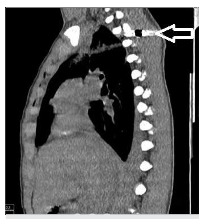
Figure 3. Sagittal view of the thorax computed tomography showing hyperdensed contusions extending from the anterior to the posterior in the right upper lobe and metallic artifact under the skin in between muscle planes adjacent to the right second thoracic vertebra transverse process (white arrow)

and was stopped on the third day. A volume of 200 cc was drained on the first day, and the total drainage was 350 cc. Drainage was discontinued, and the patient was discharged on the fifth day of hospitalization. Written informed consent was obtained from the patient's legal guardian for the use of his medical records in research.