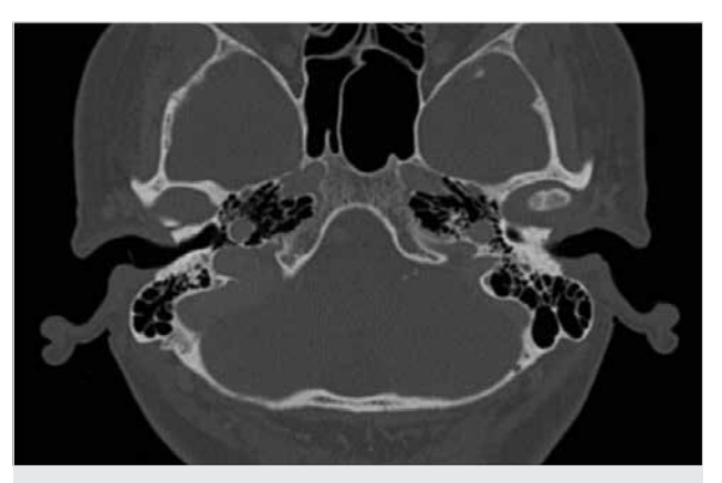
Figure 1. Axial high-resolution temporal bone computed tomography shows bilateral symmetry and almost equal diffuse pneumatization of the petrous apex

Twenty-six patients with temporal bone trauma were excluded from the study. The medical records showed that preliminary diagnoses of the remaining 166 patients were non-pulsatile subjective tinnitus (13.2%), vertigo (11.4%), hearing loss (46.3%), otitis (35%), and otalgia (7.2%). Table 3 shows the temporal MDCT findings of patients with petrous apex pneumatization. Excessive temporal bone pneumatization (57.2%) and high jugular bulb (JB) (21.7%) were found to be the most prevalent variations in patients with petrous apex pneumatization.