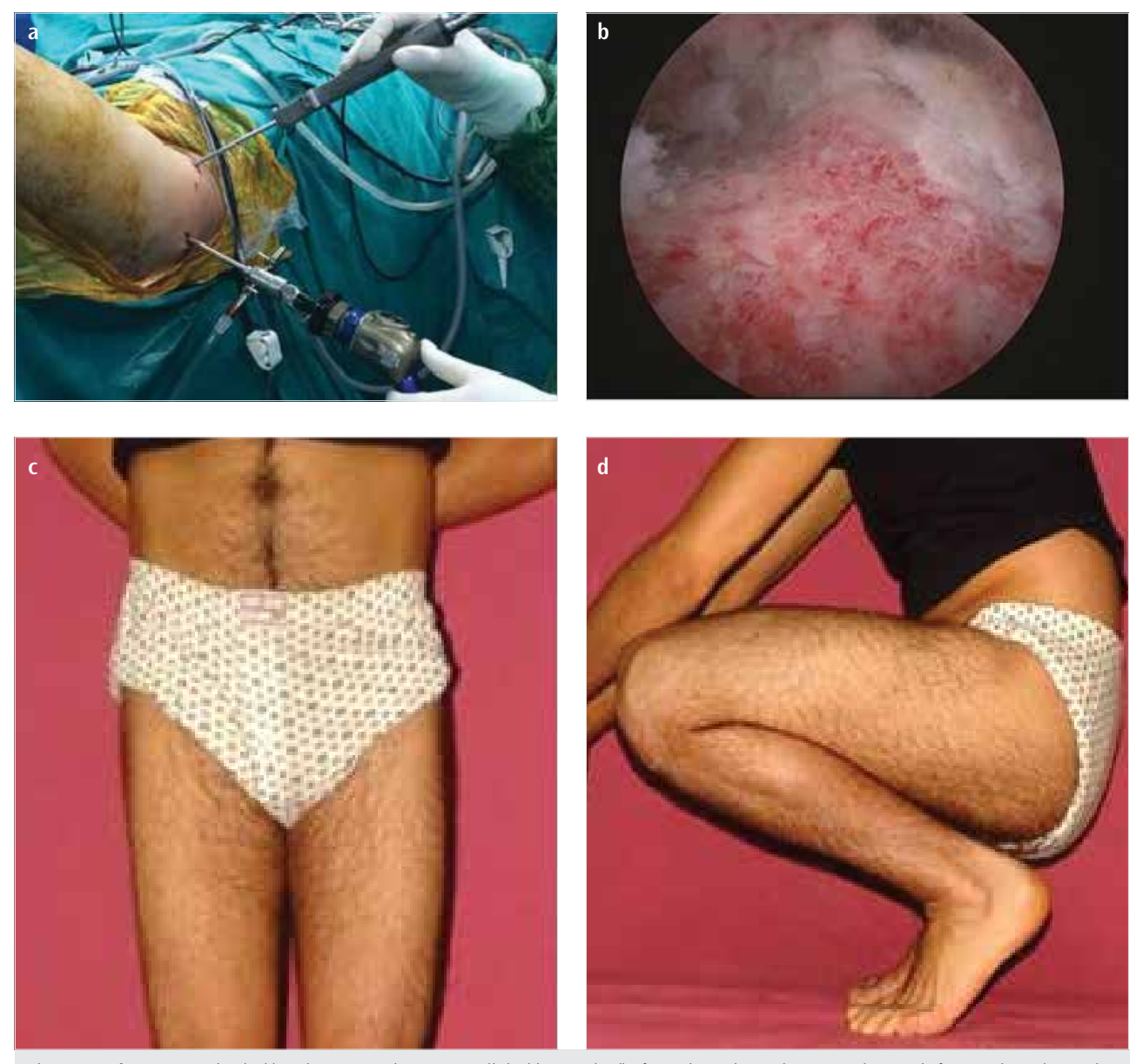
Figure 2. a-d. Intraoperative (a, b) and postoperative 1st year clinical images (c, d) of a patient who underwent arthroscopic femoroplasty due to the limitation of movement ability