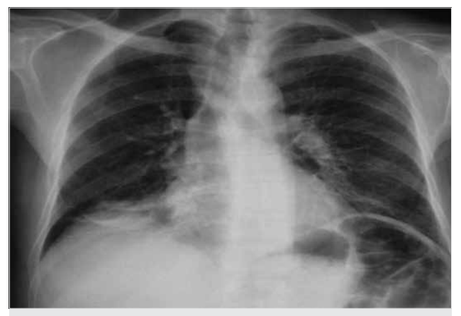
Figure 1. In PA chest radiography, a band of gray shade adjacent to the diaphragm in the base of the right lung