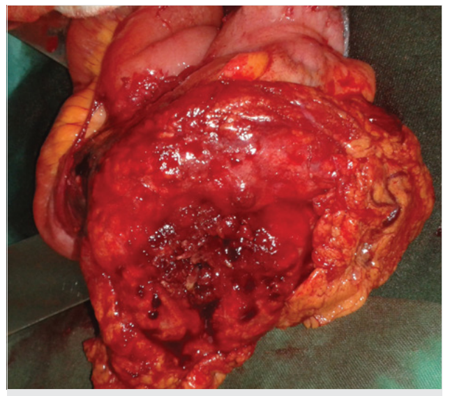
Figure 2. Operative image of inflammatory mass in the cecum and small intestinal segment

emphasized that rather than diagnosis of CD development after appendectomy, CD diagnosis should be made during the surgery period. They evaluated the clinical appendicitis of these cases as the first CD episode (6). CD limited to the appendix is very rare and requires detailed pathological examination (7, 8). In our study, no abnormalities were detected in the appendectomy pathologies, and the first episode of the cases that might be evaluated as CD complication was presented as clinical acute abdomen.